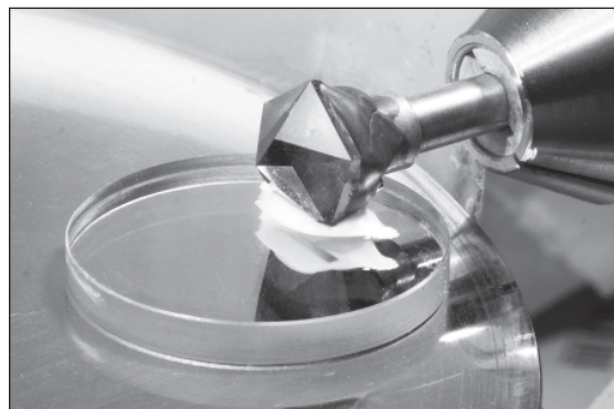
Figure 7-34 A small blob of toothpaste between the gem and mirror will reveal any tilts between the girdle facet and the lap surface.

When the gem and glass make contact, the opaque whiteness of the toothpaste disappears. More than likely, this will be along one edge of the girdle facet. Adjust the cheater and cutting angle until the toothpaste film disappears uniformly. Voilà, you have the correct transfer cheat!