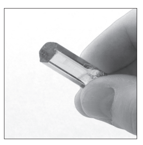
Figure 12-33 Aquamarine, a form of beryl, has characteristic crys tals whose habit reflects its underlying hexagonal crystal system.

The crystal habit is how a macroscopic crystal appears – what it looks like. In many instances, the crystal system expresses itself on these large scales, leading, for example, to the familiar hexagonal prism habit of aquamarine (Figure 12-33). Different conditions during crystal growth can lead to a wide variety of different outcomes (or habits), however. For instance, most sapphire crystals display the classic, tapering, hexagonal crystal habit, but those from Montana frequently appear flatter and tablet-shaped.